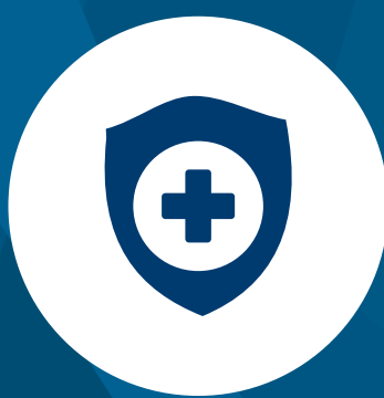
1. Establish Safety Protocols