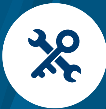
7. Secure Tools and Machinery