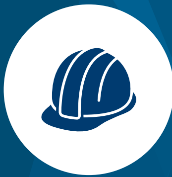
3. Wear Personal Protective Equipment