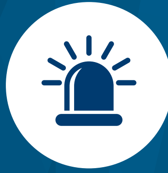
6. Use Safety Alarms