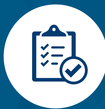
2. Always Train & Inspect