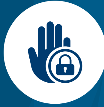
4. Limit Access to Work Areas