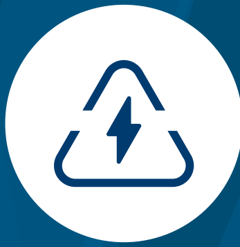
5. Don't Overload Machines