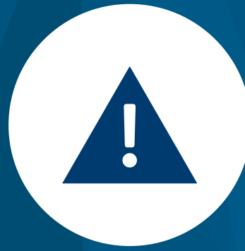
8. Have Additional Safety Measures